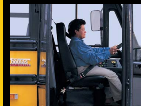
Driver is 4 feet 11 inches