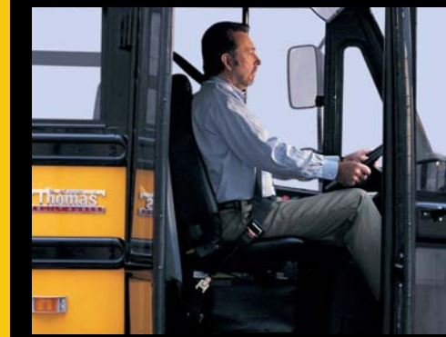
Driver is 6 feet 8 inches

Drivers come in all shapes and sizes. That's why we designed flexibility into the C2 driver environment. Some of the ergonomic innovations include easy-to-read gauges, additional legroom, optional adjustable pedals and an optional tilt and telescoping steering wheel. Plus, drivers will enjoy improved temperature controls.